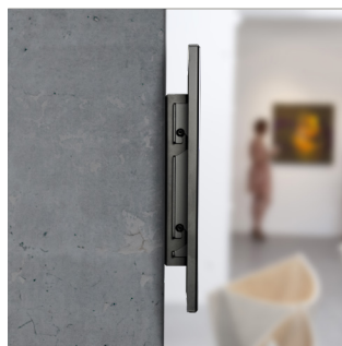
Can also be used as a standard wall mount