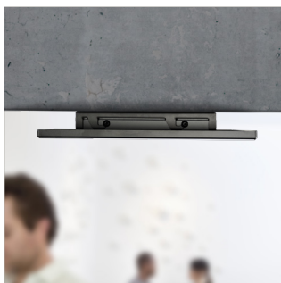
Mounts directly to the ceilings