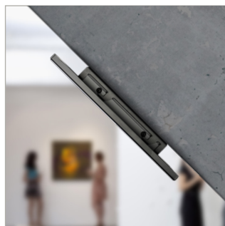
Mounts to angled walls