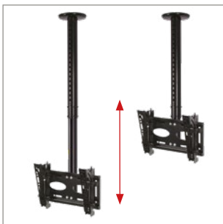
Quick and easy 'push button' height adjustment in 25mm increments