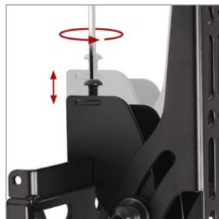
Levelling screws allow adjustment of the screen height once mounted