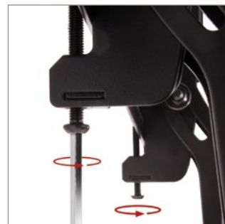
Security locking screws and Allen key provide a secure installation