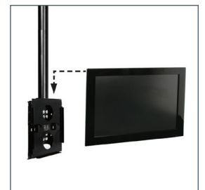
Simple hook on installation