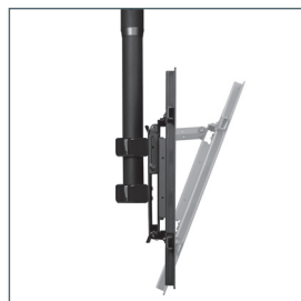
Easy adjustment of tilt