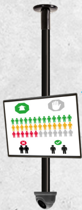
BT5700 CCTV CAMERA & FLAT SCREEN CEILING MOUNT

*Our extensive range of floor bases, ceiling mounts, poles, screen mounts & shelves allow any solution to be customised, contact us for more info. Screen / camera not included