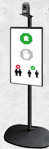
BT5750 FREESTANDING FLOOR STAND WITH CAMERA SHELF